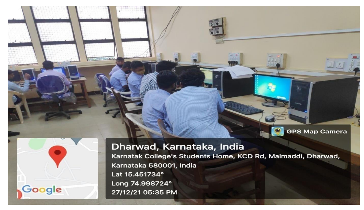
Students browsing e-content from INFLIBNET